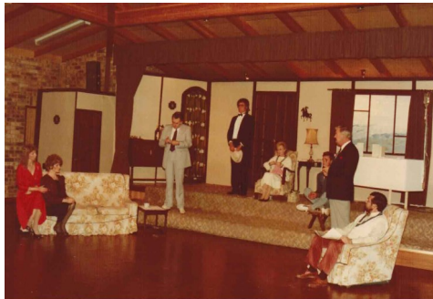
And—“The Wizard of Oz”