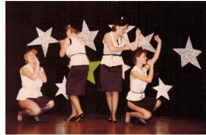
Company B Blues (featuring the Binks girls!)