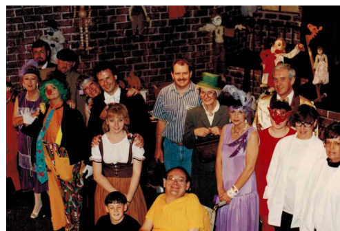
Cast & crew of "Ultimo"