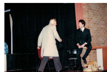
In 1989 "The Secretary Bird" & "Death of a Salesman"