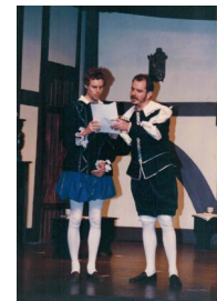
From 1988—"Fiddler on the Roof" & "Bard"