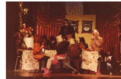
"The Anniversary" & "Toad of Toad Hall:"