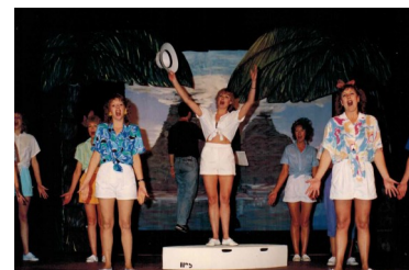
And rounding out that year was a comedy, "Why Me?" and a pantomime—"Humpty Dumpty"

"South Pacific" was the first production staged in the "Limelight Theatre" in 1989