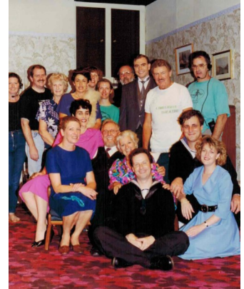
"Sweet Bird of Youth"