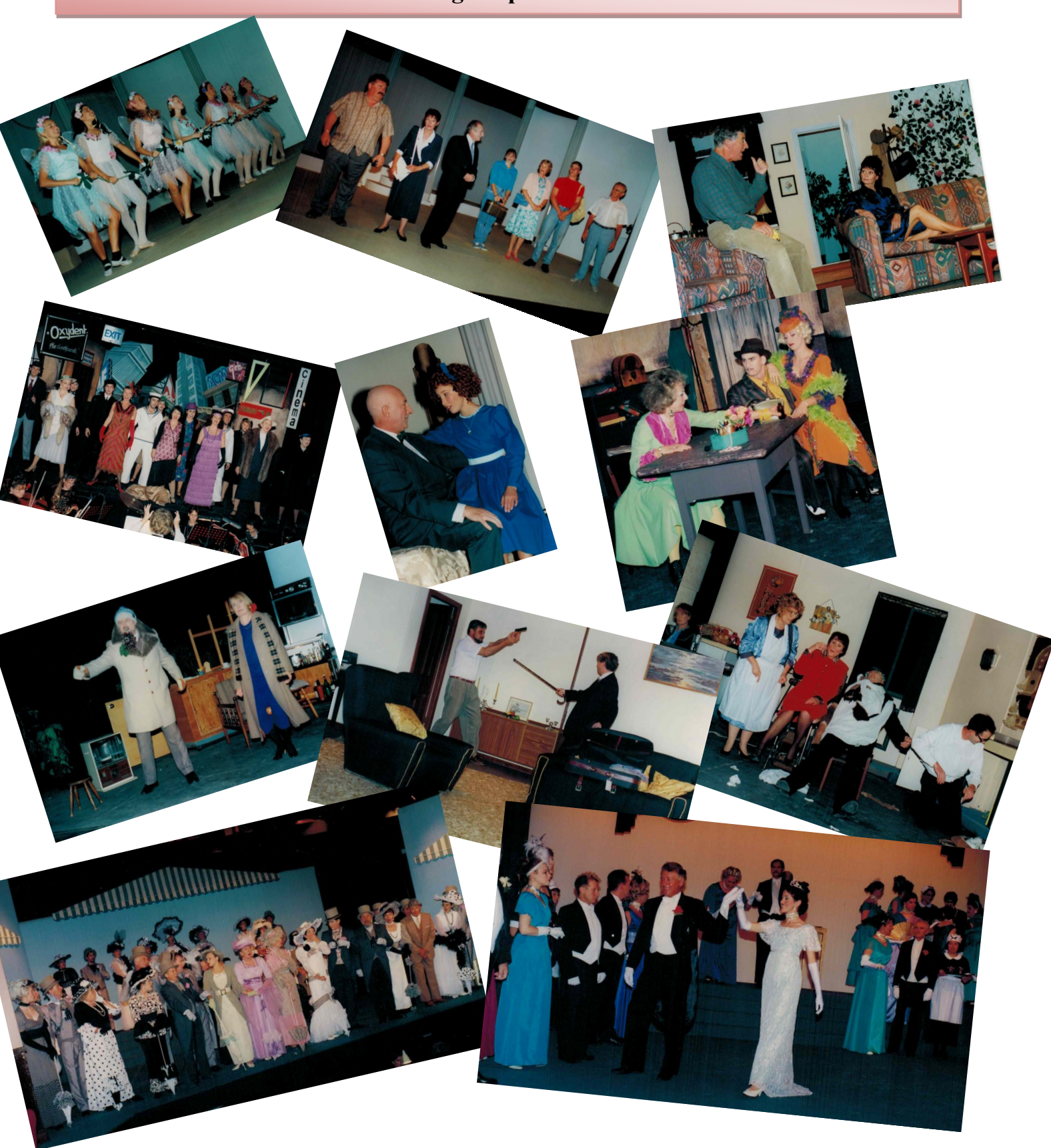
"Away", "My friend Miss Flint", "Annie", "Absurd Person Singular", "A Touch of Danger" & "My Fair Lady"