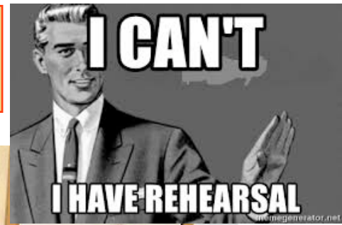
"The Two of Us"